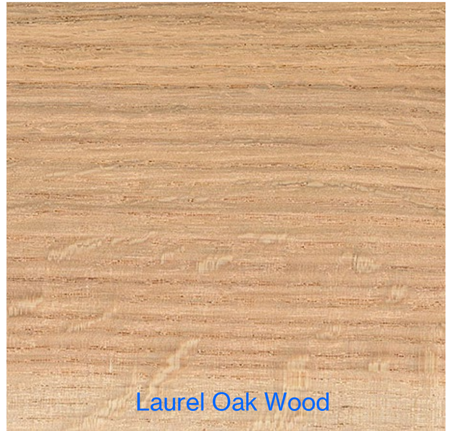
Laurel Oak Wood