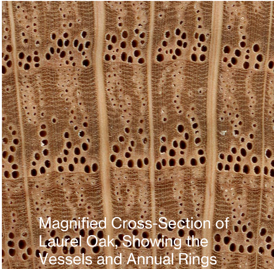
Magnified Cross-Section of Laurel Oak, Showing the Vessels and Annual Rings